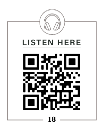
OR IN THE SPOTIFY PLAYLIST