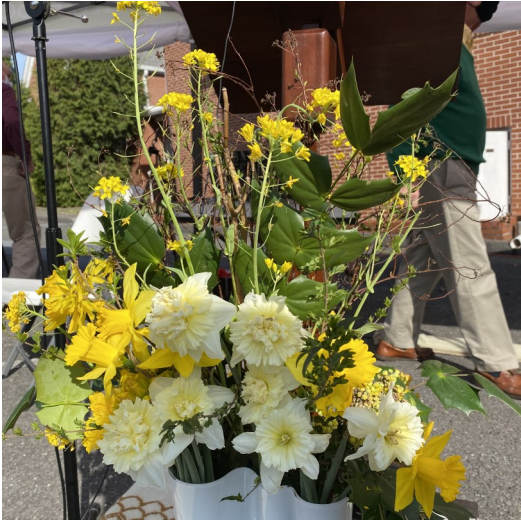
Beautiful Altar Arrangement by Lynda Climer