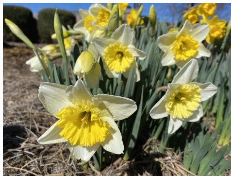
Church Daffodils praising God!