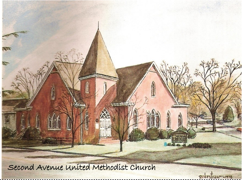
Second Avenue United Methodist Church

Our Mission: 'Making Disciples of Jesus Christ for the Transformation of the World'