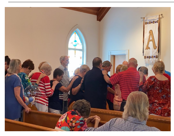
Praying together as a congregation