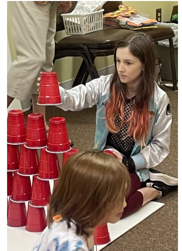
Our "Enchanto" VBS blessed many lives this year—children as well as adults!