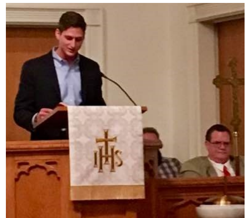
Sub-District Christmas Carol Sing-a-Long