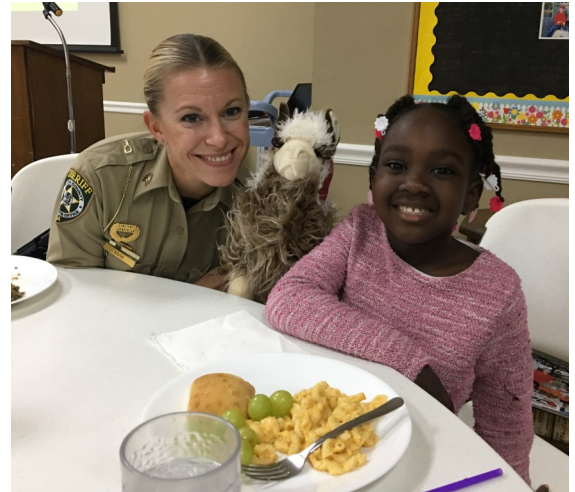
Church Safety Officer from Floyd County Sheriff's Office