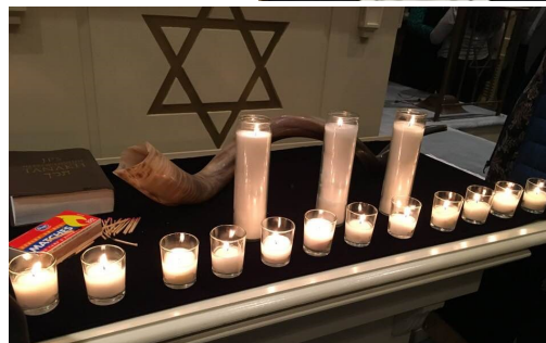
The Rodeph Sholom Jewish Congregation service of solidarity