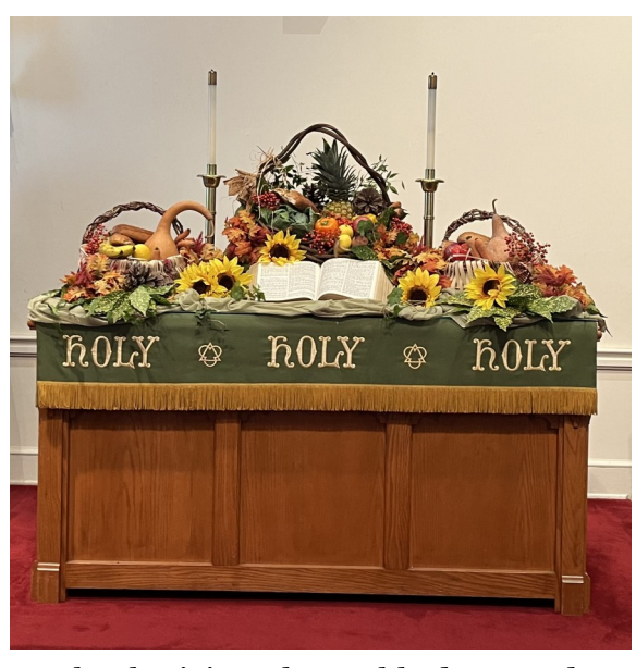
Thanksgiving Altar Table decorated by Vicki Embree