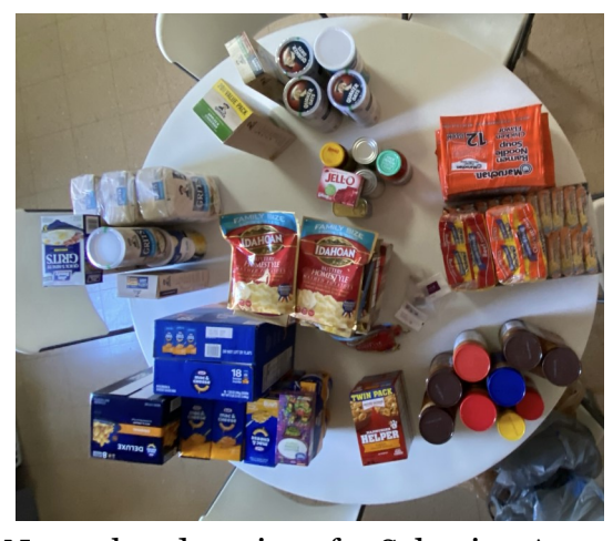
November donations for Salvation Army