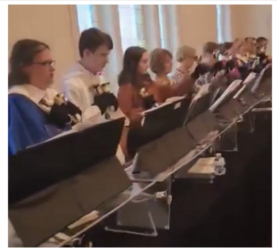
Handbell Choir performed on November 5