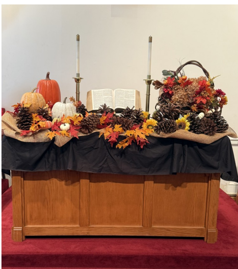
Thanksgiving Altar Table