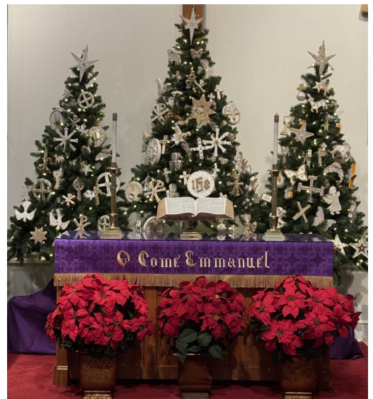
Altar decorated for Advent