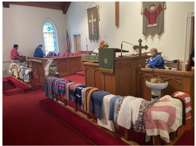
Blessing of blankets and more made by the Helping Hands ladies