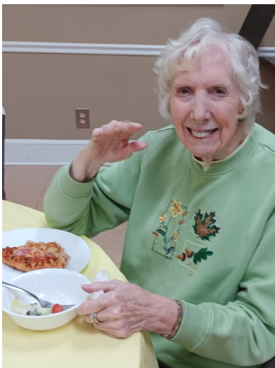
Pizza Supper and Game Night Fun