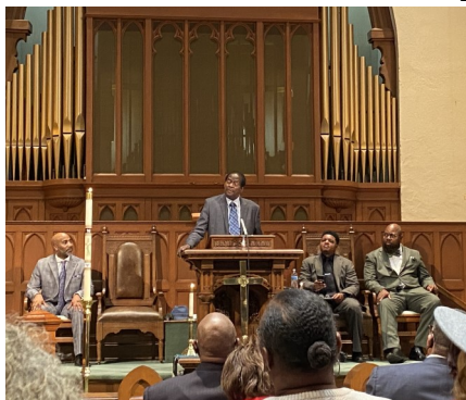
Rome Community MLK Jr. Celebration at Rome First UMC