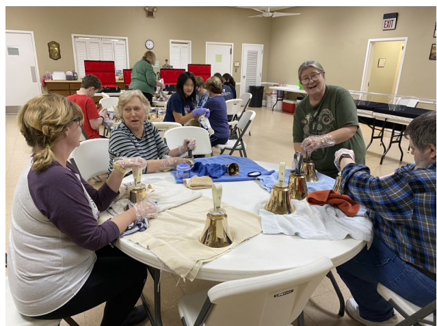
Hand Bell Polishing Party