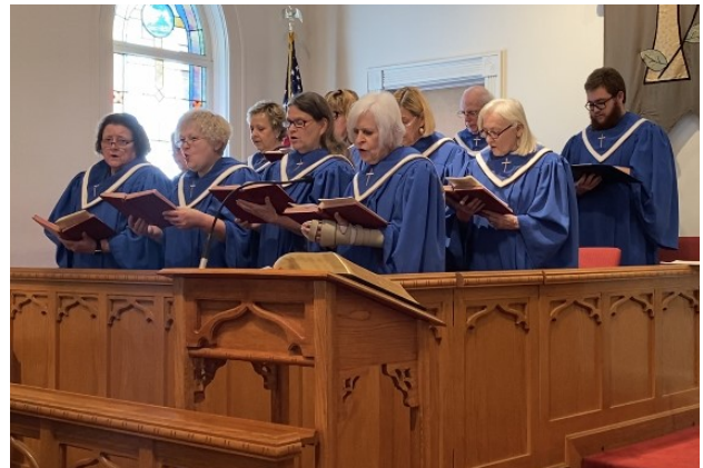
Our faithful Choir is increasing in number!