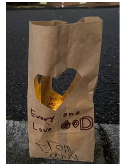
Christmas Eve Worship