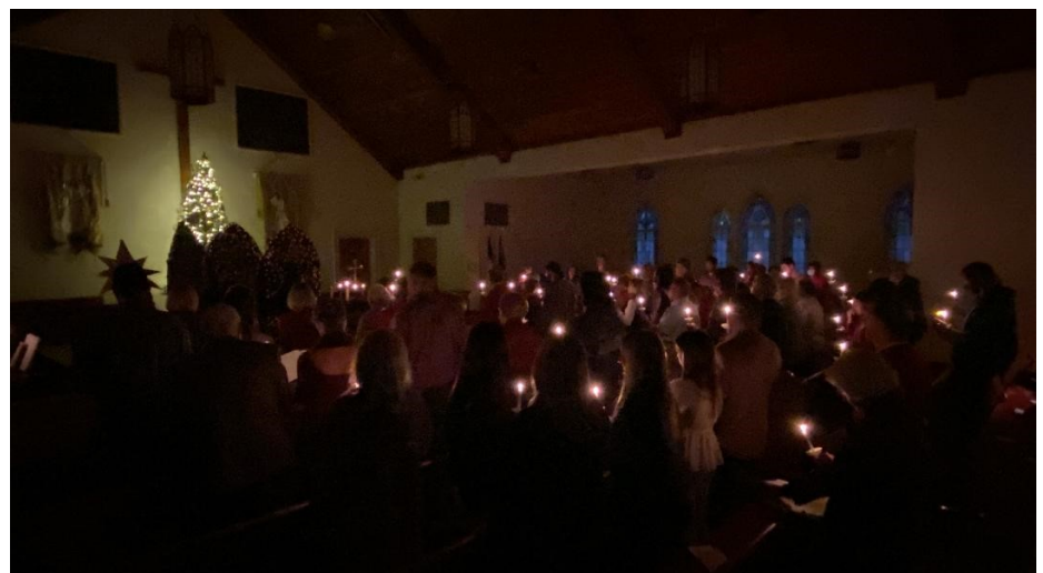
Christmas Eve Candlelight Service & Christmas Pageant.