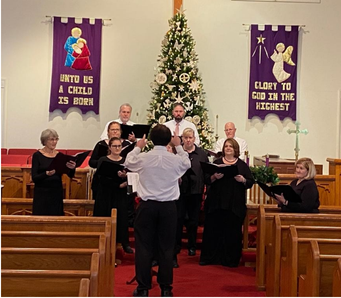
Our UMW sponsored a Christmas party & the Northwestern Singers provided the music.