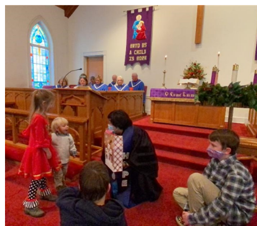
Children received their Advent Calendar.