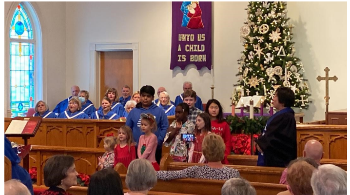
Christmas Cantata Service ! Our Handbell Choir, Children's Choir & Chancel Choir brought joy to the season of Advent!