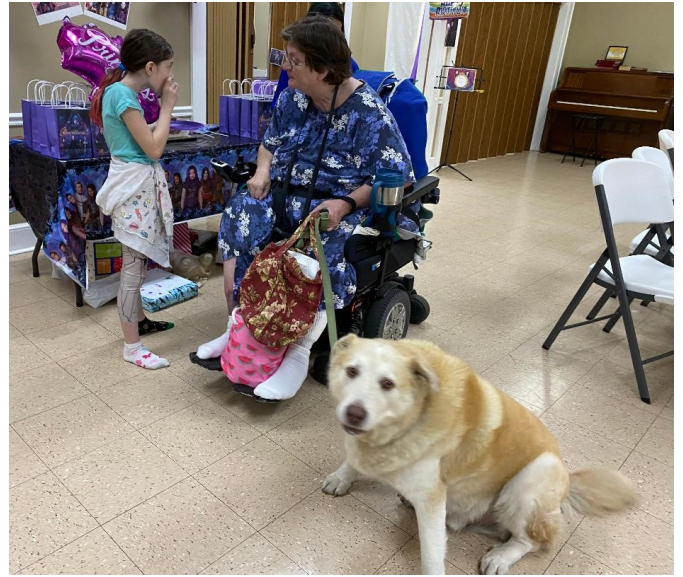
Children's outing on December 4th.