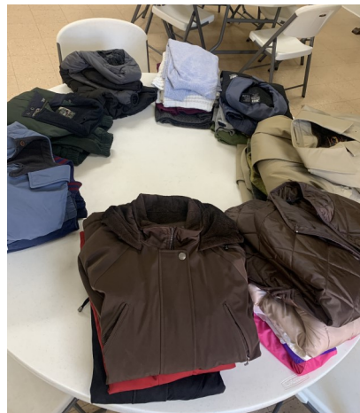
The coats we collected were donated to Loving Others Ministry, which ministers to homeless and underprivileged members of the local community.