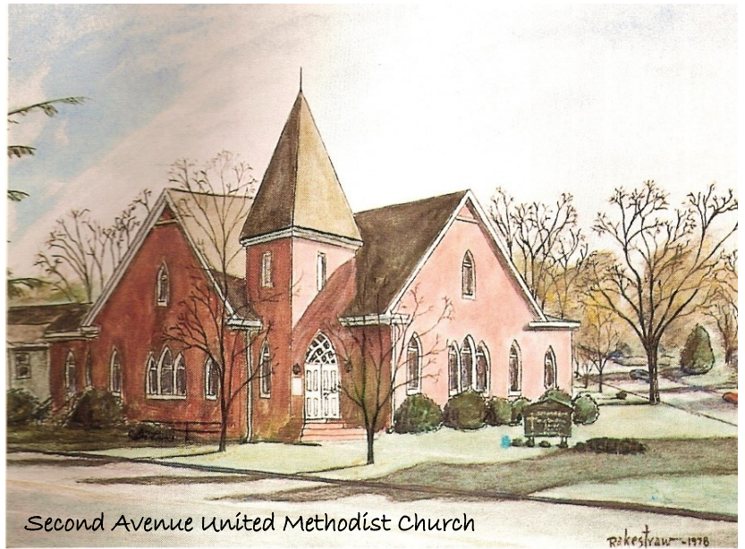
Second Avenue United Methodist Church

Our Mission: 'Making Disciples of Jesus Christ for the Transformation of the World'