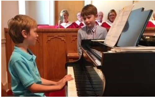
Mother's Day Worship