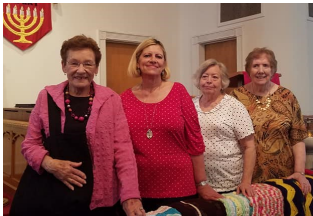
Blessing of Blankets donated by Helping Hands members.