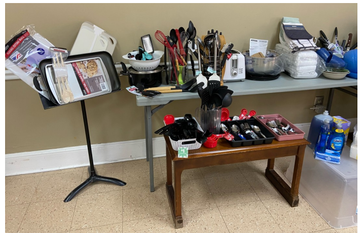
Generous donations were received for Brothers Place Ministry