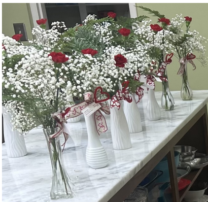
The UWF had a fun time making Valentine cards and assembling budvases to send love to our shut-in friends. They also assembled goody bags to share God's love to those served by Hope's House, a local ministry.