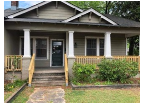
Hope's House is located at 1110 N. 5th Ave.