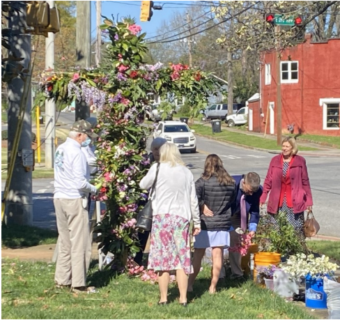
Decorating the Cross on Easter Sunday