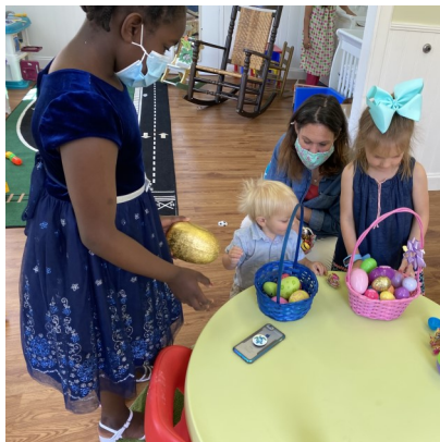
Easter Egg Hunt in the Nursery