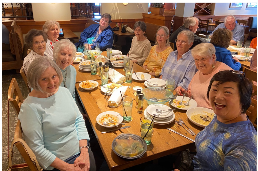
Friday Fun and Fellowship