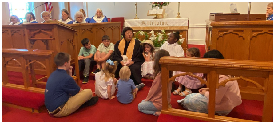
Children's Moment during Easter Worship Service