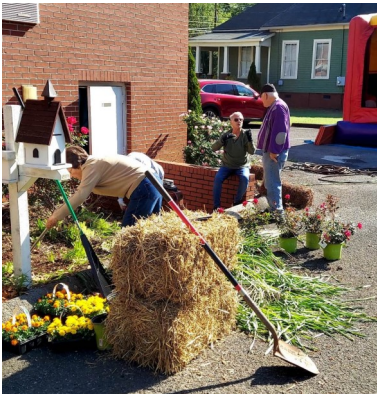
Church Work Day