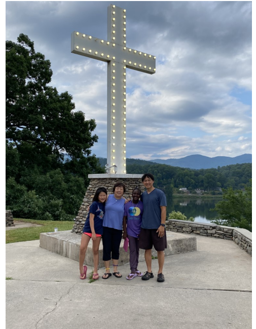
Lake Junaluska- Music and Worship Arts Week