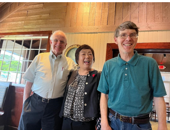
Having a great time with church family!