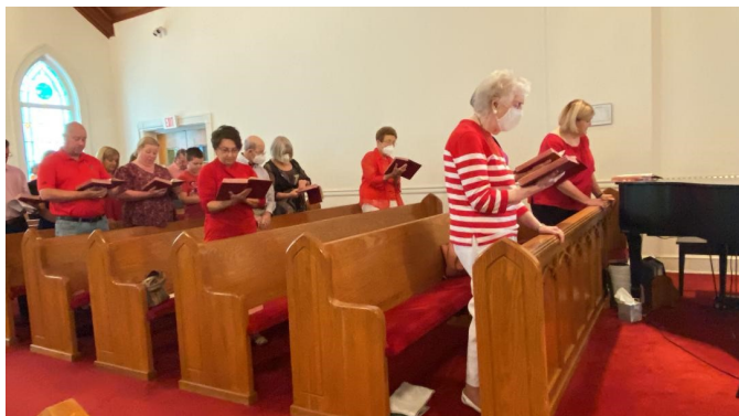
Worshippers on Pentecost