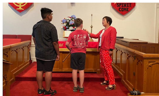
Fathers Day—Children honor their dads.