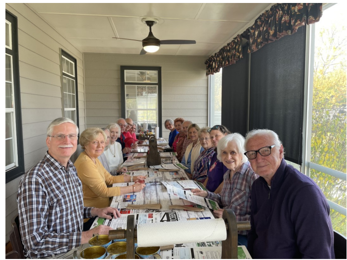
Keenagers Leaf-Peep Trip