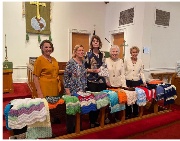
Helping Hands Blessing of Blankets