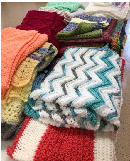
Helping Hands ladies have been busy making afghans