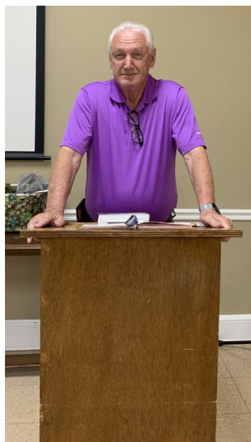
Good food and good friends at the October Keenagers Meeting.