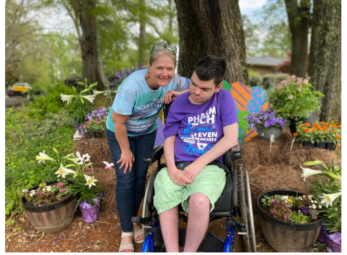
Everyone had a great time at the Easter Egg Hunt & Potluck, held at the Parsonage on April 16!