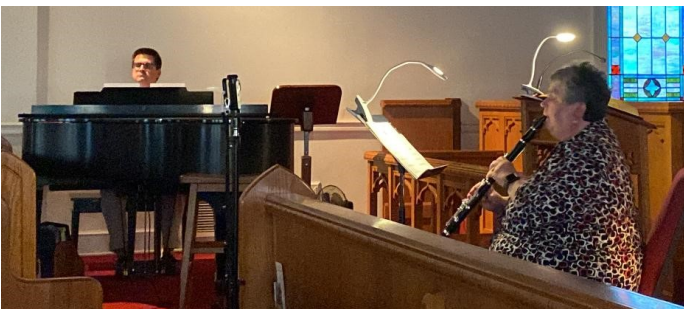
Lots of great music this month @ Second Avenue UMC!