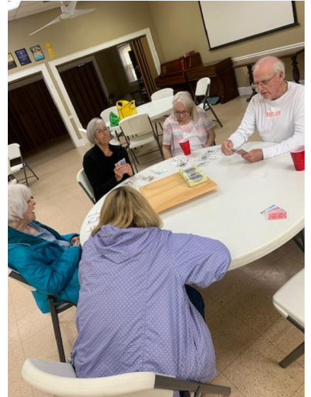
Wednesday Night Game Night & Pizza Party!